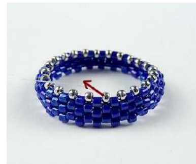
3) Make another row with SB11.