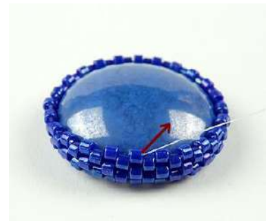
6) Turn your work and add the cabochon.