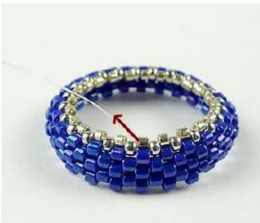
4) Make a row with DB11.