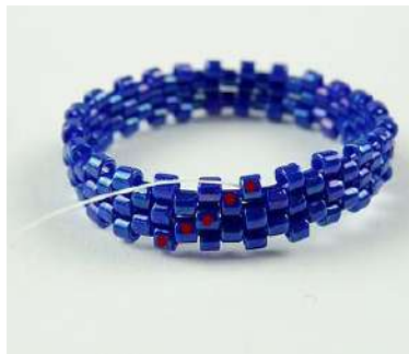
2) Using peyote technique, make 5 rows in all.