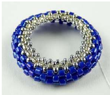
5) Make 2 rows using SB15. Pass through the beads and go out through a DB10 (1 st row added).