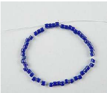
1) Tie 48 DB10 in a circle.